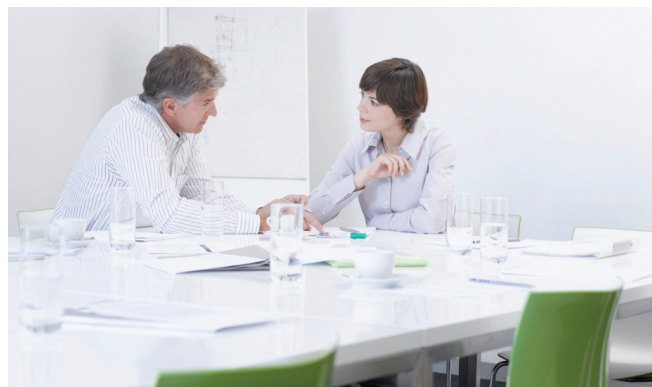
Direct modeling tools enable CAE & FEA experts to quickly prepare their 3D models for analysis and optimization.

As a rule, analysts are not CAD experts, and do not spend their time performing CAD or design work.