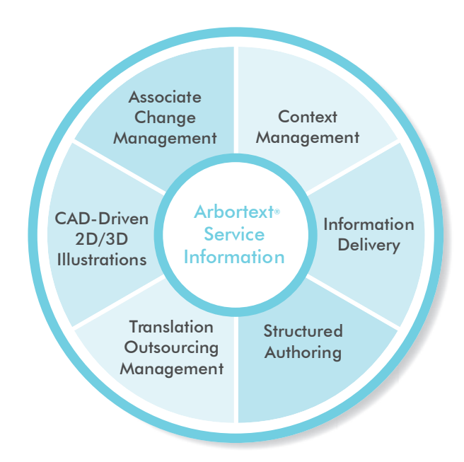
PTC has developed a proven "adoption roadmap" that allows our customers to identify and initiate their revolution at one or several points where there is the greatest benefit to the customer value opportunity.

At PTC, we offer years of experience deploying service information solutions. We recognize that the success of any new solution hinges on your organization's capacity and commitment to using it. That's why our delivery methodology incorporates a pragmatic adoption approach that helps you overcome the cultural and geographical challenges that companies often face when deploying new solutions.