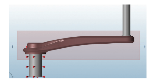
Updated design space based on initial concept generation